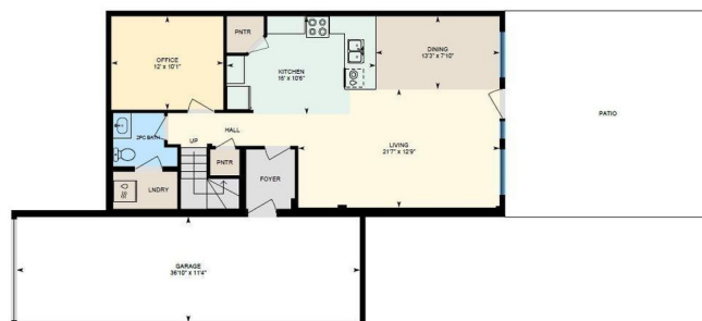
Main Floor: Interior Area 856.69 sq ft Excluded Area 415.67 sq ft